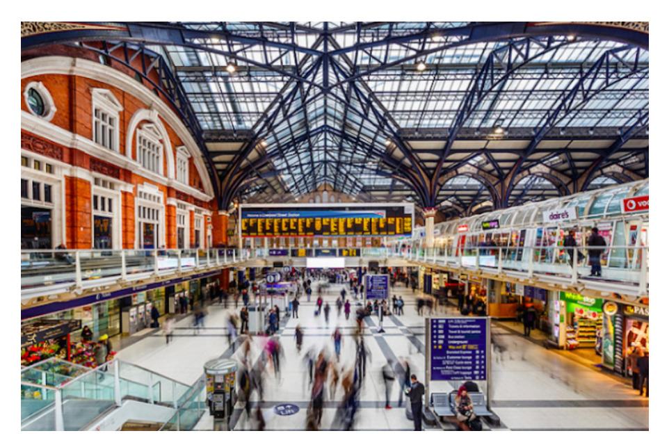
Capel C.S Ltd are pleased to announce the completion of their facility refurbishments works at London Liverpool Street Rail Station with client Greater Anglia. The project commenced late 2022 and was completed as per schedule in less than 4 weeks.