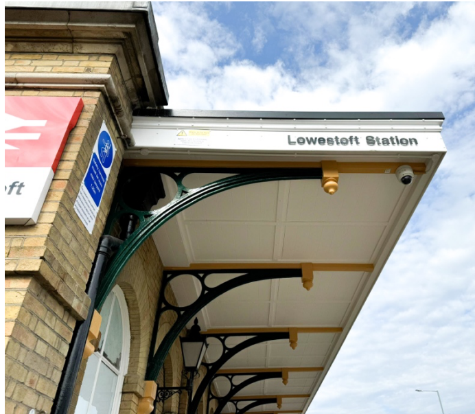
Lowestoft Rail Station.

London, 7 th October, 2024- Capel C.S Ltd , a leading name in the construction industry, is pleased to announce a project completion for Greater Anglia involving refurbishment works at Lowestoft Train Station in Suffolk. The construction contractors were brought on board by long-term client and UK-leading TOC (Train-Operating-Company), Greater Anglia (GA), after working on various projects on their network over the last few years.